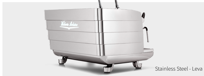
Stainless Steel - Leva